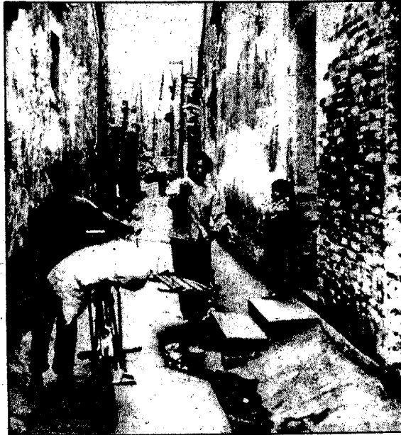
A back alley in Nanshan Village. Most of the inhabitants have the surname Chan. One of its most famous emigrants was Lung Chin, Stockton's potato king during the early 20th century.

Compared to other counties in the Pearl River delta regions, Doumen does not have a large population, it being 180,000, with another 60,000 workers, on two state farms, recruited from outside the country. Included among the state farm population are about 6,000 of China's 250,000 Vietnamese Chinese refugees. I was told that the government allotted about RMB $1,800 for resettlement of each refugee, and new housing has been provided for them. However, some of the Vietnamese Chinese, hailing originally from urban areas, have had difficulties adjusting to the spartan simplicity of rustic life and have tried to steal across the border, attracted by the bright lights and apparent opulence of Macao and Hong Kong.